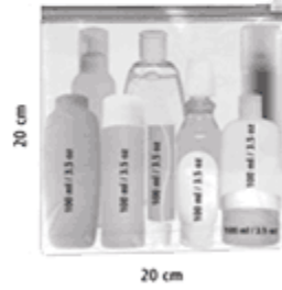
LIQUIDS, GELS AND AEROSOLS